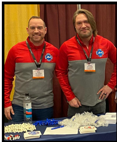
NAFED - Las Vegas 2023

NAFED Conventions: Our team participated in the NAFED Conventions in Las Vegas and Chicago, networking with industry leaders and staying abreast of the latest trends and regulations in fire protection. We showcased our comprehensive insurance solutions at these expos and connected with contractors and clients to address their unique insurance needs.