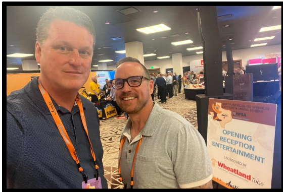
NFSA - Austin, Texas - 2023