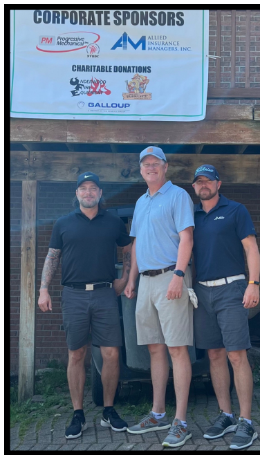
NFSA Golf Outing - Oxford, MI - 2023

NFSA Events: We were featured speakers at the NFSA Annual Conference in Austin, Texas and attendees at the NFSA Golf Outing in Oxford, MI where we engaged with peers and shared insights on best practices in fire safety.