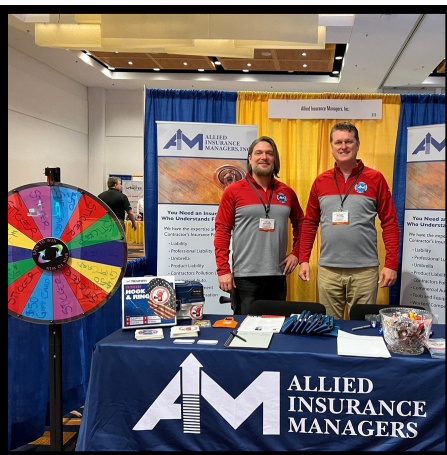
NAFED - Chicago 2023